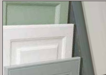
PU Painted Shutter